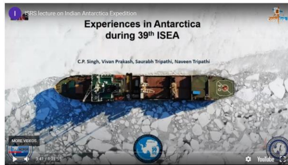
World National Technology Day Lecture by ISRO Participants of Indian Scientific Expedition to Antarctica (ISEA-39)