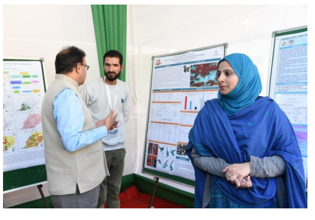
Inauguration of Poster Session by President, ISG &ISRS and the visitors at the poster presentation area