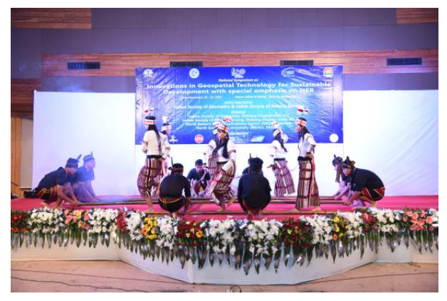
Cultural Programmes showcasing the culture of Assam and Mizoram States