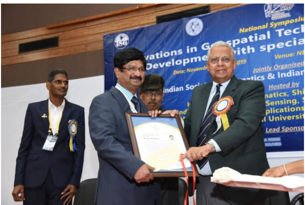
Governor, Meghalaya distributing Annual ISG and ISRS Awards