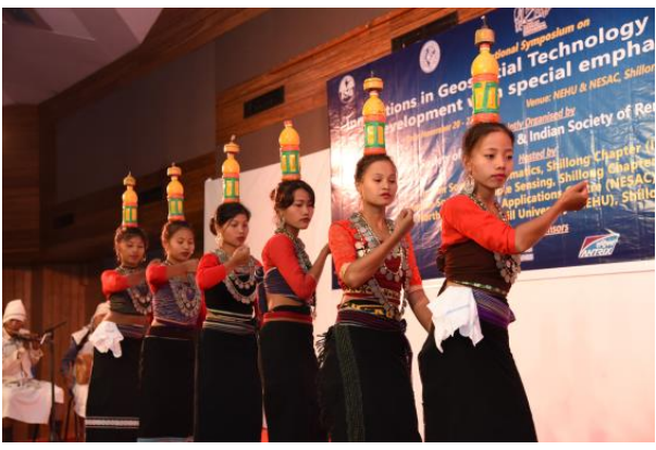
Cultural Programmes showcasing the culture of Manipur and Tripura States