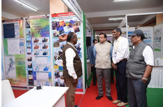
Visitors at the Exhibition area